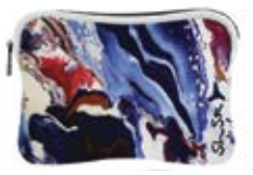
Neoprene Sleeves Front