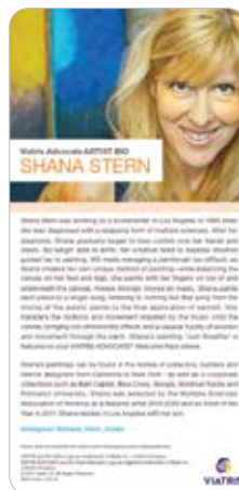
Artist Bio Card

Included inside the VIATRIS ADVOCATE Welcome Pack you'll find: